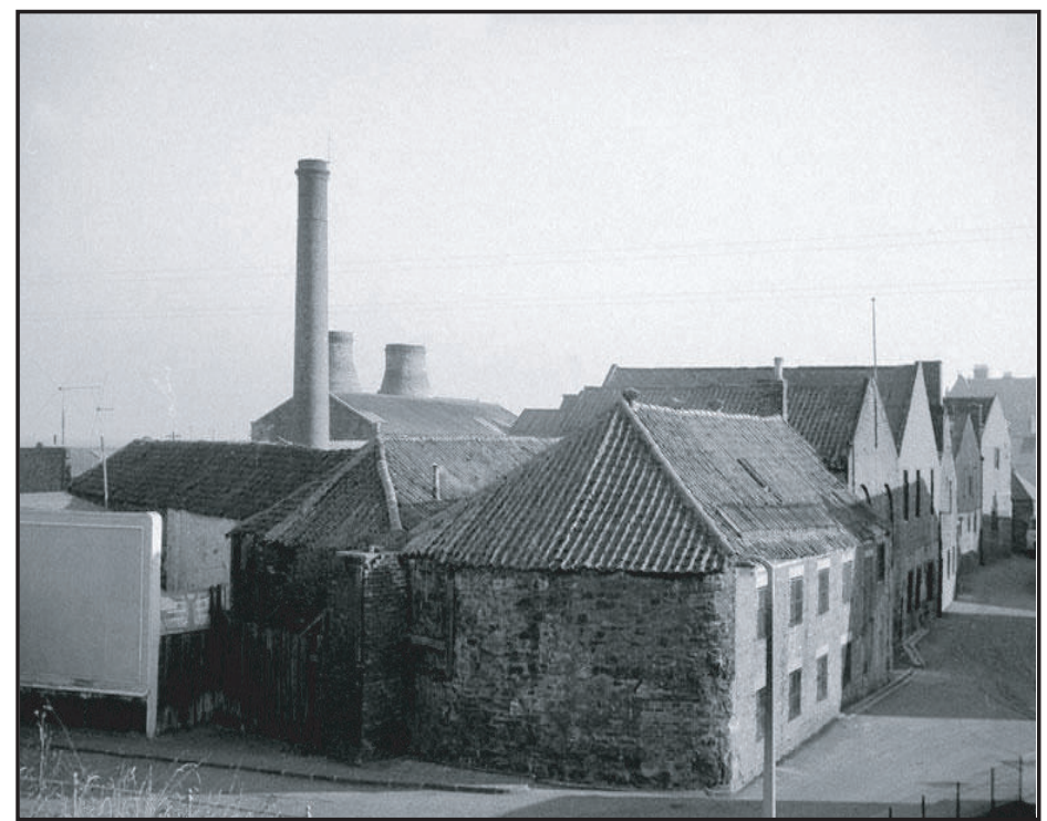
Exterior of AW Buchan and Co. works - Mid 20th Century

During March and April 2013 AOC Archaeology Group, in conjunction with the City of Edinburgh Council Archaeology Service, will be monitoring development works at 1 Bridge Street, Portobello, in order to recover information about the local ceramic industries. Archaeological works have been commissioned by MNM Developments Ltd as part of the proposed residential development of the site.