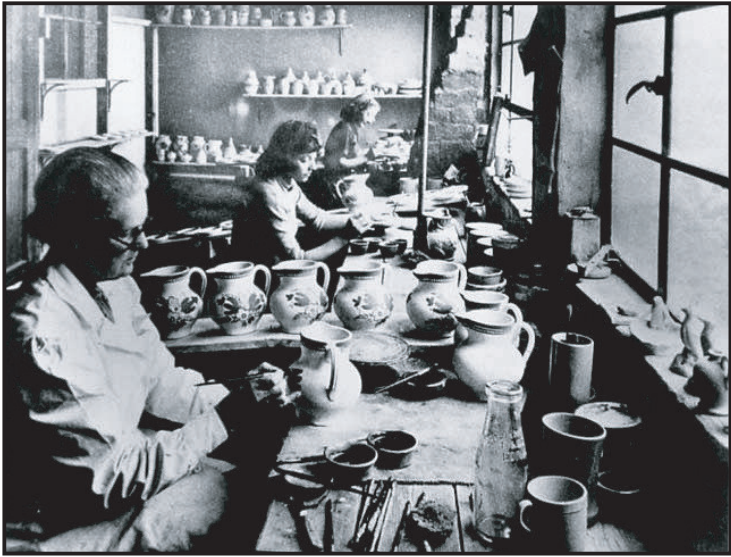
AW Buchan and Co. Factory, mid 20th century

Portobello reputedly got its name from a house built around 1750 by a sailor who had been present at the taking of the town of Portobello in Panama ten years earlier. He built his house on Figgate Whins, a desolate and undeveloped section of coast between Leith and Musselburgh. In 1765, rich clay deposits were discovered just to the west of the Figgate Burn, and this led to the establishment of brick, glass and pottery works, a soapworks a white lead works and associated workers' houses. A small harbour was constructed at the mouth of the burn in 1787, providing burgeoning industries access to trade around the North Sea and further afield.