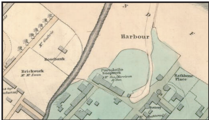
Extract from John Wood's 1824 Survey, showing the Position of the Harbour